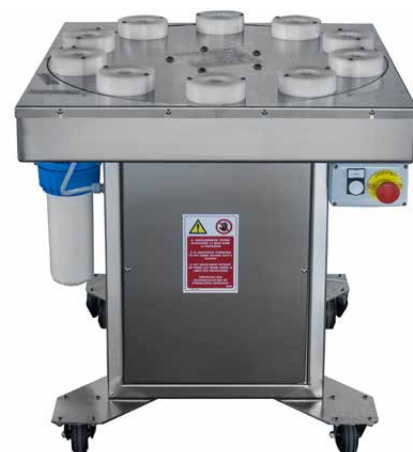
Water Recycling Tank