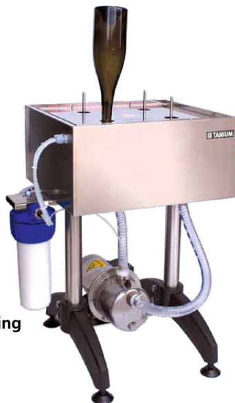
Water Recycling Tank